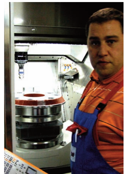
With 3D Form Inspect, even machine operators are highly motivated.

with this software but could also pass on his knowledge to others. Perfect."