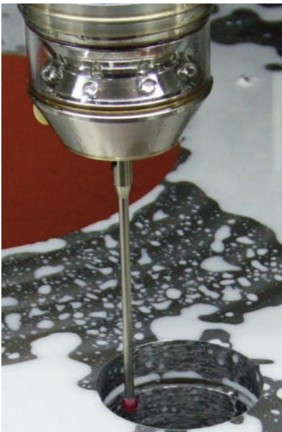
Determining position and fit size with 3D Form Inspect

Since 2001, LARO NC-Technik GmbH has been a legally independent company within the Langer Group and has been manufacturing moulds and tools, prototype parts, small batch volumes and specially commissioned orders. Strengths have been developed in the field of milling, where workpieces from large to small sizes are machined. At Laro, large means