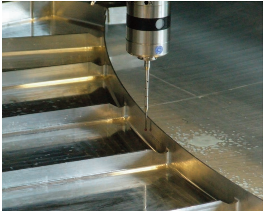
Thin cross-sections are measured while still clamped on the machine.

The machine operator determines the points and areas to be measured on a computer using mouse clicks based on the CAD data of the workpiece. 3D Form Inspect automatically generates the required measuring program and also creates a calibration program to allow and compensate for thermal changes of the machine axes. This procedure is patented by m&h. This is the only way to achieve reliable and repeatable